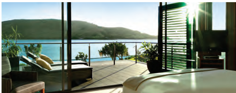
Yacht Club Villa